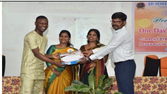
Prize Distribution for Best Posters