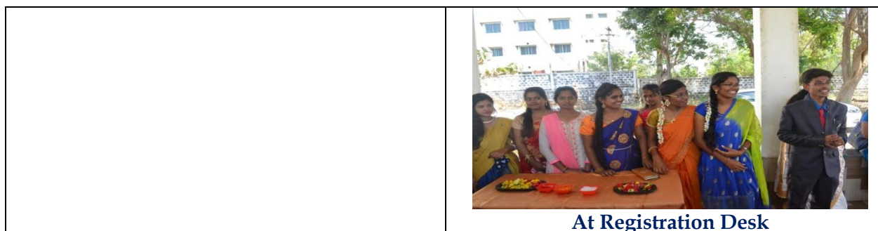
At Registration Desk