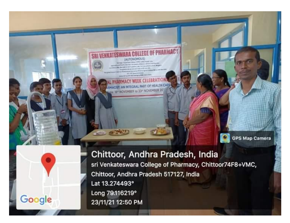
Competitions conducted to students