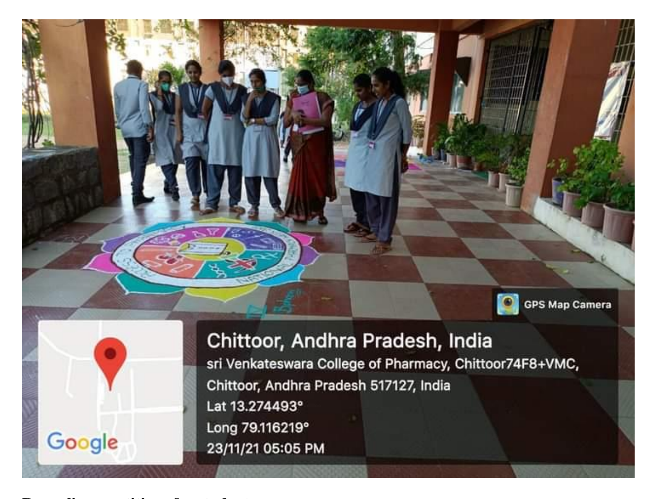
Rangoli competitions for students